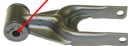
Torque Strut Mount

For more information, please contact our Technical Support Department at 800-444-4616