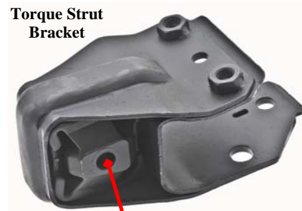
Bushings and rubber compound can wear out over time due to constant engine torque and extreme temperature variances.